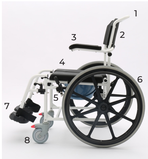
Self-propelled Luxury Shower Commode