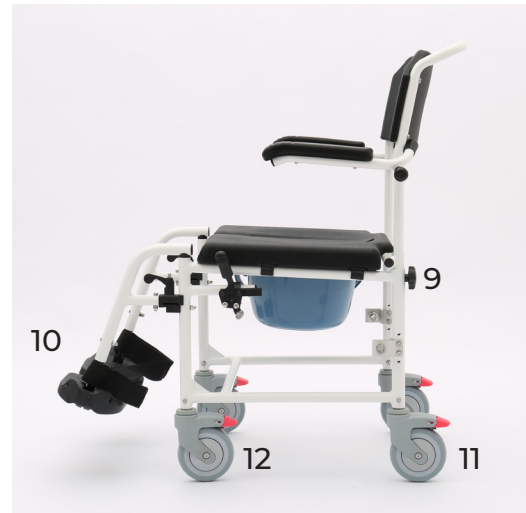
Transit Luxury Shower Commode